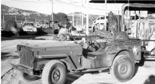
MTM's 1942 Kurtis Jeep replica, awaiting installation of its windshield, features an early WWII Ford GP-style grille.